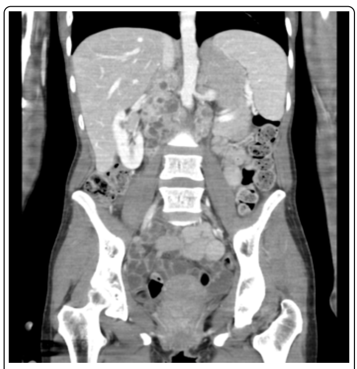
Figure 3: CT of the Thorax, Abdomen, and Pelvis with contrast. Demonstrating a large, irregular, lobulated retroperitoneal mass lesion containing multiple, well defined, cystic areas in the upper abdomen straddling the midline.

examination and CT findings, this was also deemed unnecessary. The presence of strong family history for inherited breast cancer in this patient may have indicated further evaluation for BRCA1 and BRCA 2 tumour suppressor gene mutations. Following the spinal decompression, her condition continued to decline, and her mobility remained poor. Physiotherapy and palliative radiotherapy were planned but deferred due to her rapid deterioration. She was discharged home with a full package of care and passed away shortly afterward.