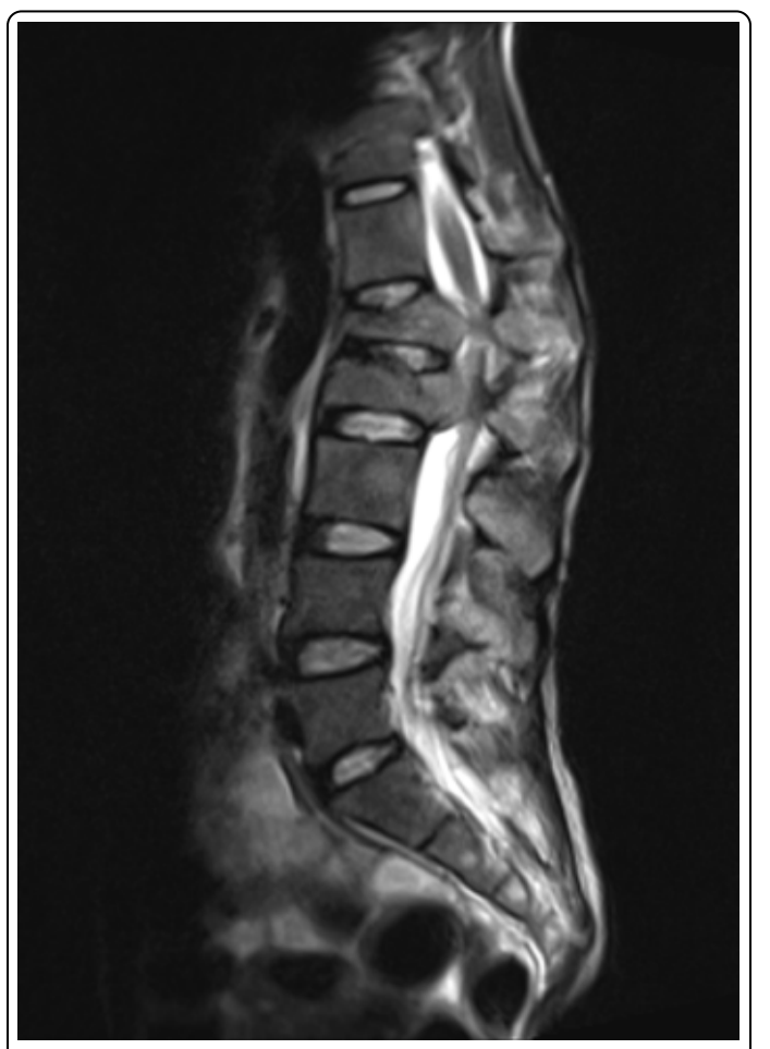
Figure 2: T2-weighted MRI demonstrates collapse fractures of L1 and L2 vertebrae with diffuse signal abnormality throughout the body and extending into the pedicles. There is also marked bulging of the posterior cortices of these vertebrae into the spinal canal.

Citation: Hind J, Sidhu GA, Powell C, et al. (2020) Carcinoma of Unknown Primary (CUP) in Female Presenting with Lower Back Pain: An Important Clinical Lesson. Onco Tum Res 1(1): pp. 1-3.