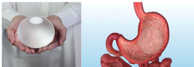
Figure 3: Transmurial colonic necrosis, with nonviable mucosa and sub-mucosal edema (black arrow), hemorrhage and congestion of wall (star), partially preserved colonic mucosa (arrowhead), HE \times 10.